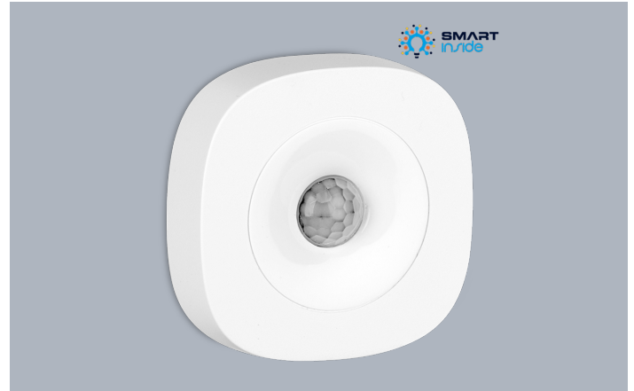
AOne™ PIR Sensor