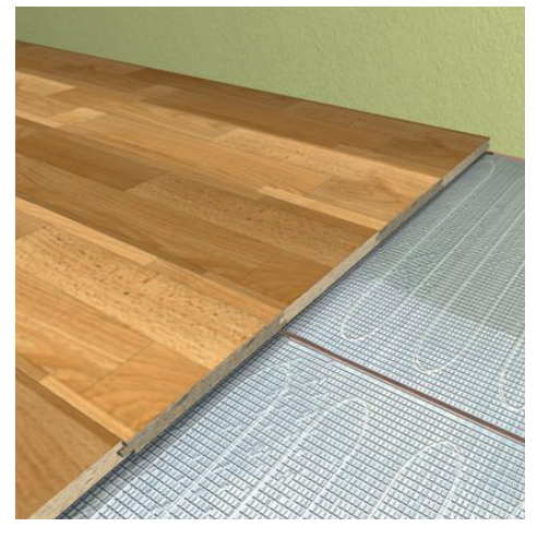
F Series foil heating mat specifically designed for laminate and engineered wood floors

The mat runs should be taped down using AL-50 aluminium tape. One roll of tape will be required for approximately 10m<sup>2</sup> of floor area.